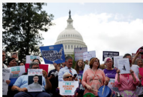
Activists participate in a rally in late September to protect the Affordable Care Act outside the U.S. Capitol in Washington.

The Michigan Catholic Conference initially filed its lawsuit in May 2012, one of several Catholic groups to sue the federal government over the Obama-era HHS ruling that required religious organizations and employers to provide contraception and abortion-inducing drugs in their employee health care plans.